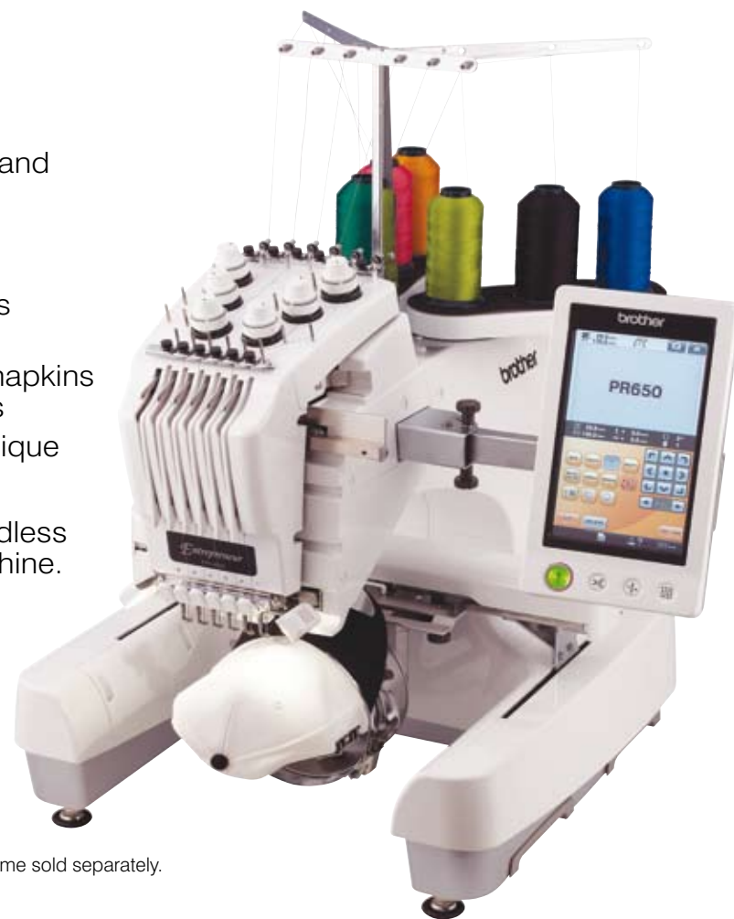
Cap frame sold separately.